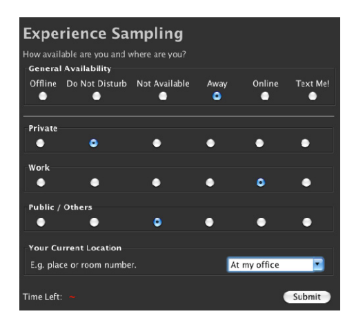
Fig. 2. Experience Sampling interface for collecting user selective availability preferences

Skype, as all our participants are frequent Skype users and thus used to these levels. We preferred this over using a five-point Likert-scale or a simple binary assessment of "Available" versus "Unavailable".