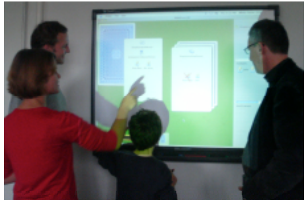
Figure 1. FamilyFaces scenario.

In this paper we present the concept and implementation of the FamilyFaces—a contact management tool supporting families when managing their contacts and information disclosure. The FamilyFaces (cf. Figure 1) is based on the principle of an ongoing process of selective information disclosure of the respective family towards their social contacts. So, besides simply creating and maintaining contacts like in traditional address books, the FamilyFaces also allows the family to specify their preferences concerning the information they want to share with the