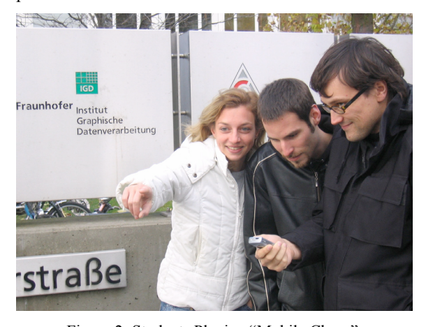
Figure 2: Students Playing "Mobile Chase".

Exactly as in the classic archetype a team of players runs through town marking their route each time they change direction. A team of pursuers starts with a several-minute delay in order to track down the first group. Instead of using chalk arrows, in "Mobile Chase" the first team has to mark each shift in direction with a photo, which is then geo-coded using GPS and uploaded to the server by the cellular phone.