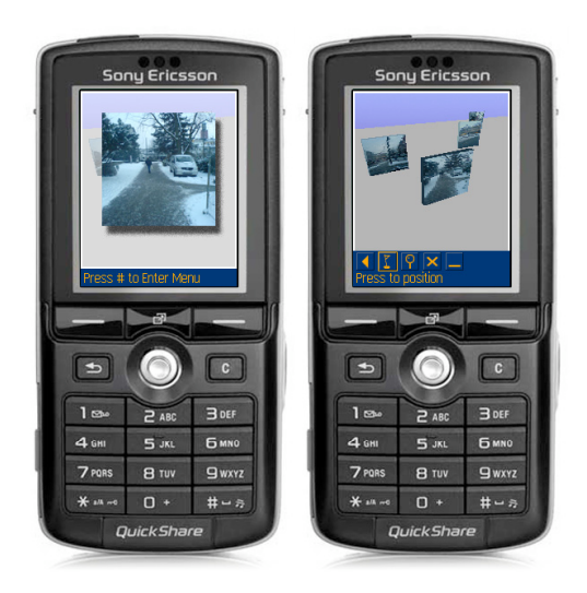
Figure 3: Zoomed view of the next Marker and a view of the 3D display of the playing field showing four Markers and the game menu.

to deduce information out of the playing field like the distance and the direction from one shown place to the next one. Technically the visualization of the markers was realized by using textured cuboids which were added to the 3D scene. By that it was possible, on the one side, to support the pursuing team in their task without, on the other side, providing the players' with too much information like in a regular street map where the additional information like the road names would have affected the complexity of the players' task.