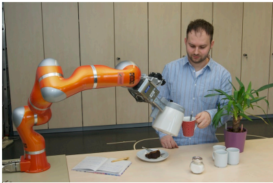
Figure 2. Example picture for introducing participants to the topic.

towards interaction in general and modalities specifically. Regarding task allocation, we focused on kitchen work, deskwork, and handicraft—typical areas where a desk-mounted robotic arm can help. For each of these contexts we asked participants how they would allocate tasks between them and the robot.